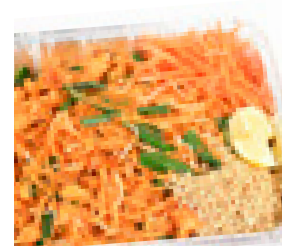
Thai - Chicken Pad Thai