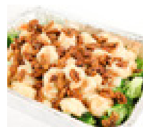
Honey Glazed Walnut Shrimp