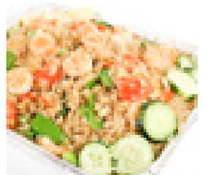
Thai - Shrimp Fried Rice