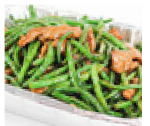
Beef w. Green Bean