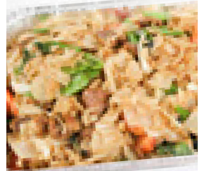
Thai - Crazy Noodle