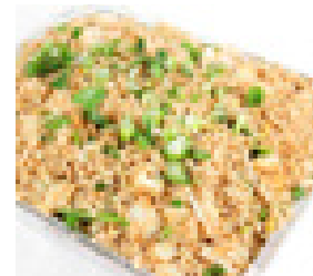
Vegetable Fried Rice