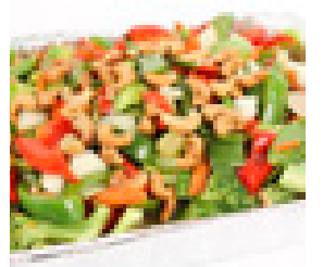
Thai - Cashew Vegetables