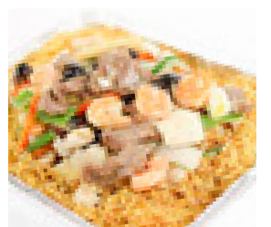
Chi Tung Special Pan Fried Noodle